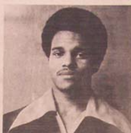
MORRIS BROWN Grand Blvd. Area