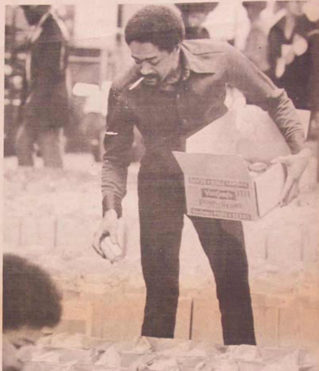
BOBBY SEALE, commenting on the Free Food Program: "If there are no concrete programs to pull the people together. . . , to unify them, then we are doing nothing."

One phenomenal thing occurred. The young Black brothers and sisters who were sorting the boxes of wholesale can goods that we bought (we got them wholesale, without the label) lined up chairs all across the warehouse, and in about every two or three seats we would seat one of the elderly sisters who was there from the church. They couldn't pick up the heavy boxes, so we gave each of them a black felt tip pen. We had the young brothers and sisters take the boxes to the elderly women so they could write "corn", "peas", "beans", or whatever the name of the food was in the can. What was happening? The elderly mother and the young brother, who were basically disunited in the community, were unified within the framework of the survival programs. They began talking with each other, caring about each other, it really dawned on me then what unity in the Black com-