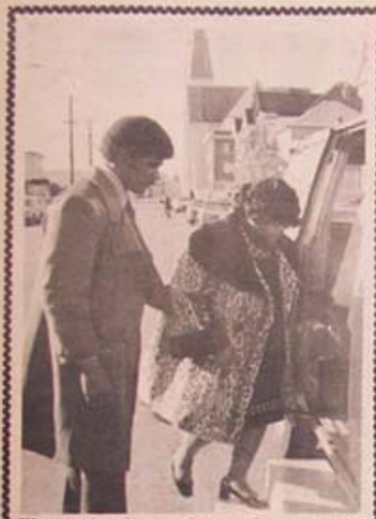
We must unite to change the neglected situation of the elderly. They deserve the best.