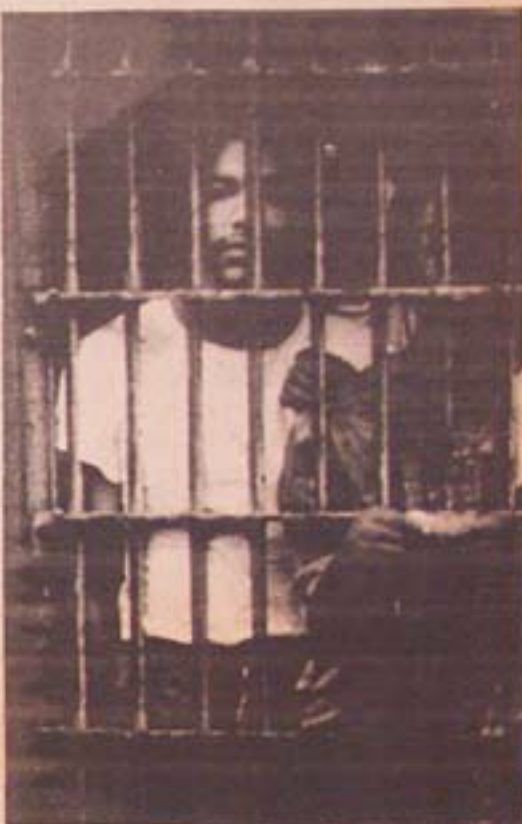
If the measure of a society is revealed in its prisons, American society deserves our outrage.

The disciplinary procedure is discriminatory, unlawful and an incredible farce. The Disciplinary Board consists of a captain, a "counselor" and one or two guards. A prisoner goes before this board if disciplinary reports have been